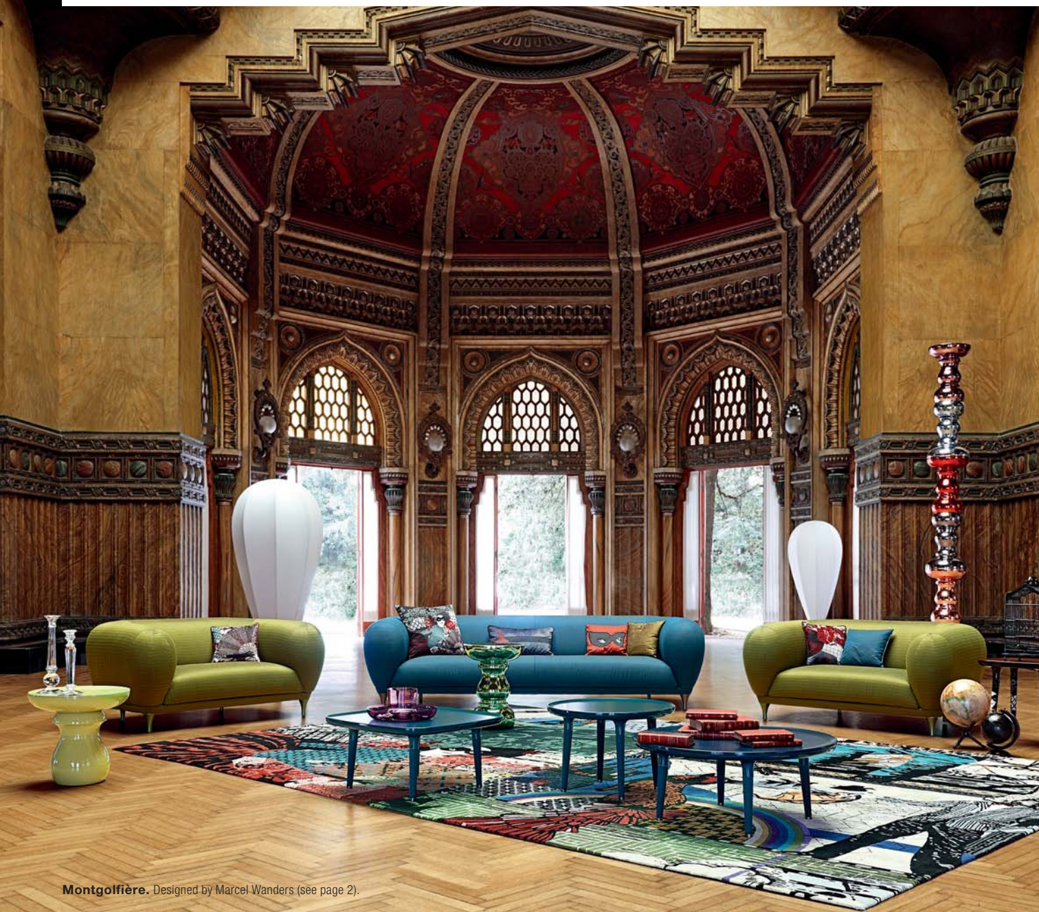
Montgolfière. Designed by Marcel Wanders (see page 2).